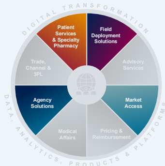
Integrated Solutions to Overcome Any Challenge